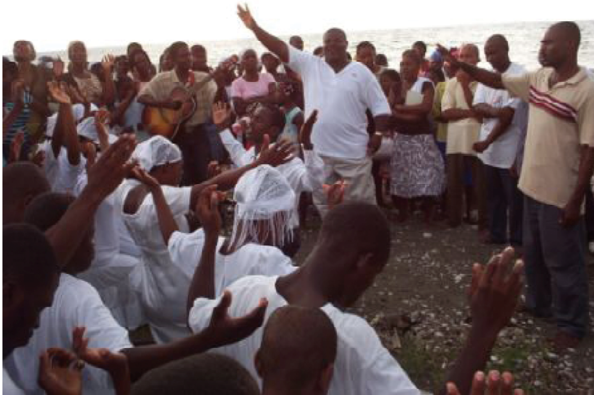
Water Baptismal Service

I N Haiti with the on-going food crisis, people are hungry and are seeking help and during their search, many end up coming to our churches. During this crisis, we are finding that people are not only hungry for food, but there is an increased hunger for spiritual things as well. Our Pastors in Haiti report that each week as people come to receive food staples that we try to keep on hand, they are accepting Christ also. After they receive Christ and are given some teaching, they are then baptized. Our churches in Haiti are all filled to capacity. We tried to hold 2 morning services to accommodate the people in Nepley, however in Haiti's culture that was not successful because everyone then wanted to attend both services. They don't want to miss anything because they are so hungry spiritually. So, in order for everyone to go to church, our Pastors often have to send new Christians to churches in other villages in the Leogane region.